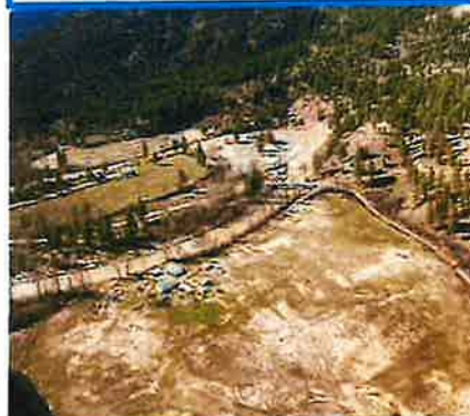
Black Bridge by Collins & Oppenheim property