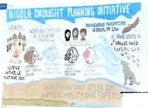
nk'e?xép Drought Committee Draft Strategic Plan